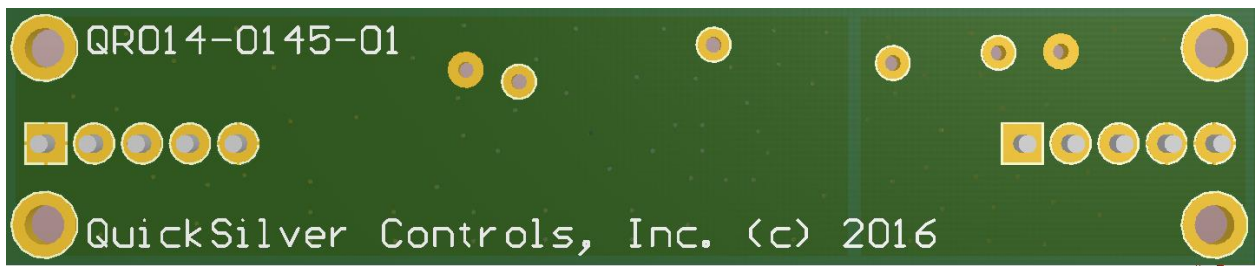
Bottom View of 2 DAC Board